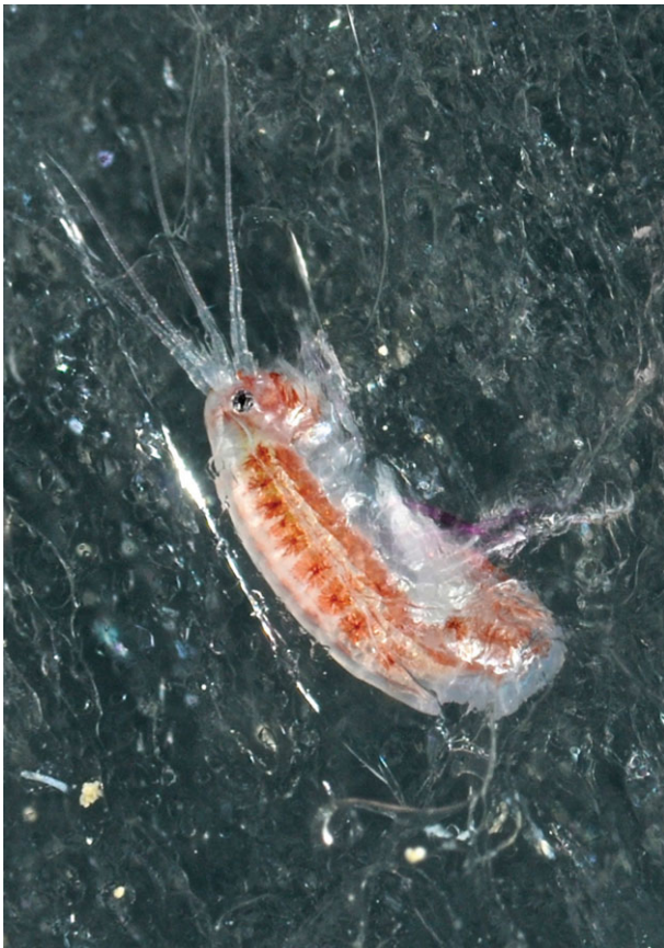
Figure 1. In situ Apherusa glacialis from sea-ice.