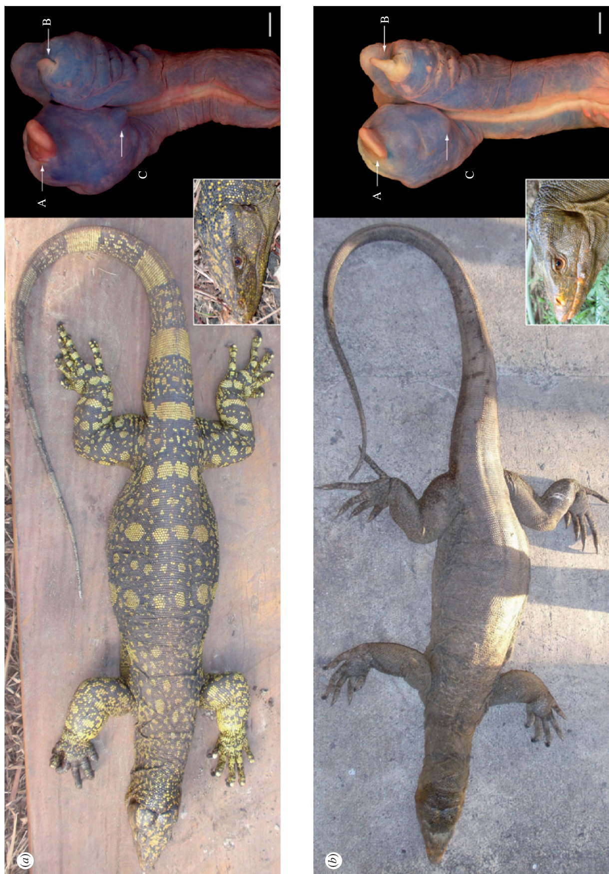
Figure 2. Dorsal views of bodies, lateral views of heads and close-ups of hemipenes of (a) V. bitatawa (PNM 9719) and (b) V. olivaceus (KU 322187). Letters indicate: A, primary apical hemibaculum horn; B, secondary apical hemibaculum horn; and C, presence or absence of an evagination at the base of the primary hemibaculum.