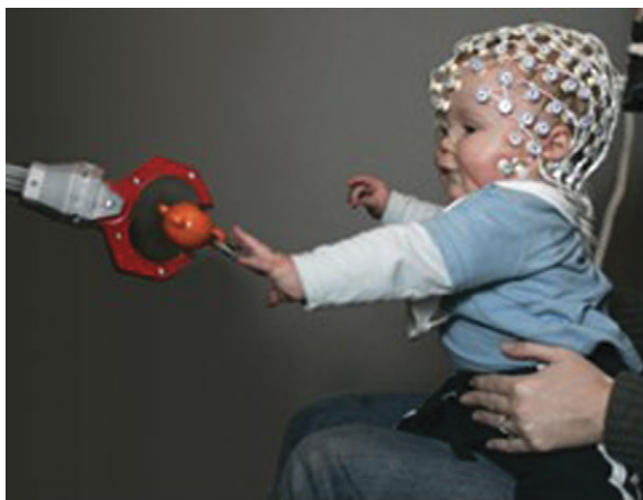
Figure 1. Experimental setup for eliciting reaching. A mechanical claw, holding a small graspable toy, is passed through the stage curtains towards the infant.

experimenter, seated on the floor to the right of the infant, retrieved the toy after allowing the infant to briefly play with it. This procedure was repeated until the infant was bored, or until they had reached for approximately 20 different toys. Pilot data suggested that very few reaching trials were required in order to observe sensorimotor alpha suppression (see figure S1 in the electronic supplementary material for examples of single trial effects). Infants contributed a mean of 10 (s.d. = 3.5) artefact-free trials to the analysis.