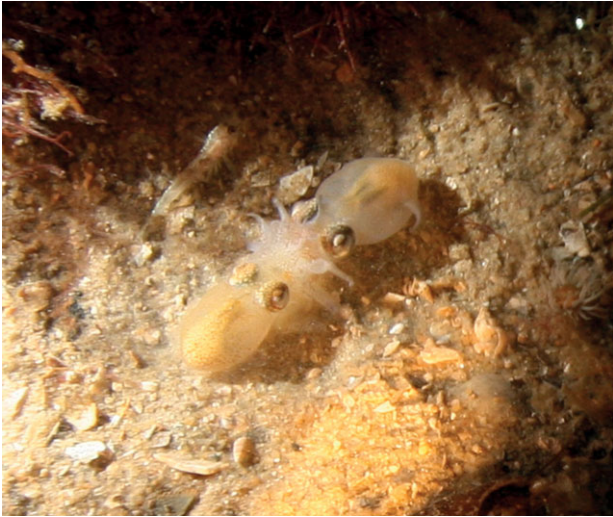
Figure 1. Mating pair of southern bottletail squid

nutrients of spermatophore consumption and (ii) the period of sperm storage in females.