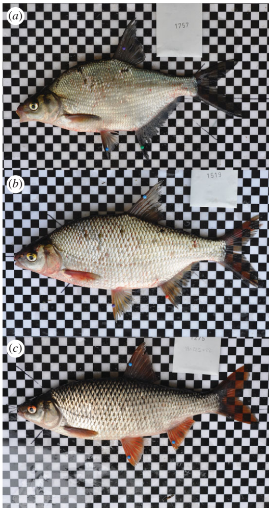
Figure 1. Photos of a bream ( a , Abramis brama ), a hybrid ( b ) and a roach ( c , Rutilus rutilus ) from Lake Loldrup. Discernible characters include scale size, fin colour, eye colour, length of anal fin, general morphology and body depth.

Predation is a ubiquitous and powerful ecological agent of natural selection [7–9] that may act as an extrinsic, postzygotic reproductive isolation barrier if invoking hybrid inviability [1]. If hybrids have intermediate phenotypes that fall between adaptive peaks occupied by parental species [10] hybrids may be removed by selection [11]. A higher probability of falling victim to predators for hybrids than parental species should provide an ecological mechanism enforcing species integrity. However, predator-mediated selection at the individual, phenotypic level is very difficult to document in nature, unless extraordinary prerequisites prevail, as shown in [9]. We here combine electronic tagging of two common freshwater fishes and their hybrids with a rare method of retrieving explicit records of individual predation events in the wild to evaluate a direct fitness cost to hybrid fish individuals due to predation by an apex avian predator.