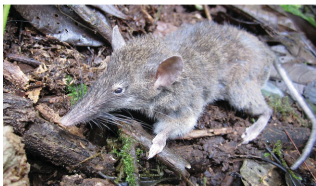
Figure 1. Holotype of P. vermidax .