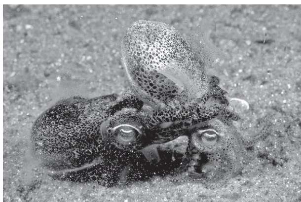
Figure 1. Euprymna tasmanica mating, male on left and female on right.