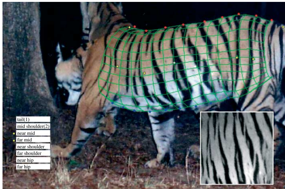
Figure 1. The three-dimensional model fitted to a camera trap image of a tiger. The yellow dots placed on the screen by the user indicate the position of shoulder, hip and tail base points and the red and blue dots indicate the upper and lower margins of the image, respectively (note the second tiger behind the first, which might make automated segmentation of the first image from the background difficult).

possible to reduce the risk of obtaining a low score between matching patterns (i.e. those scanned from images of the same tiger). One of the algorithms is robust to noise in the image but fails when regions of the image are occluded, and the other is robust to occluded regions but sensitive to noise.